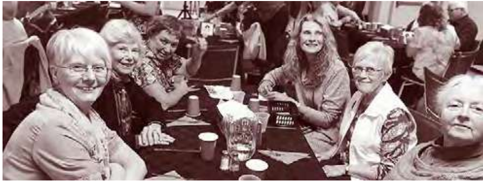
Guests enjoying our fundraising Dinner

LYU wants to thank every guest and volunteer who attended the dinner, and generously gave time and/or donations to make the evening a wonderful success!