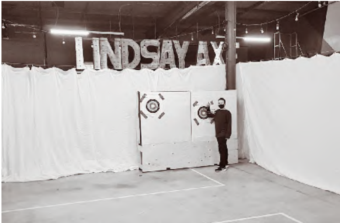
MONDAY EVENING SPRING SESSION OF ON-TARGET ARCHERY UNDERWAY

We have been enjoying once again being able to run the On-Target Archery program this spring. Though we have had to keep numbers low due to COVID regulations, our Monday evenings have still been a weekly highlight. This program has been a great way of connecting with youth through passion for the sport, skills training and sharing with them the good news of Jesus. Special thanks to the Lindsay Axe Club for hosting us!