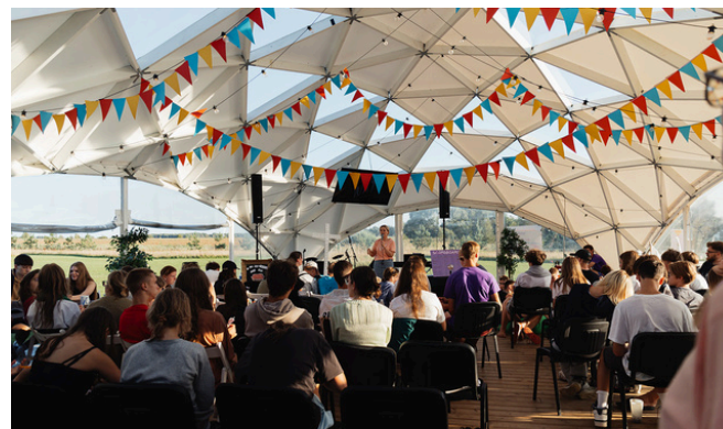
Gathering in Lithuania