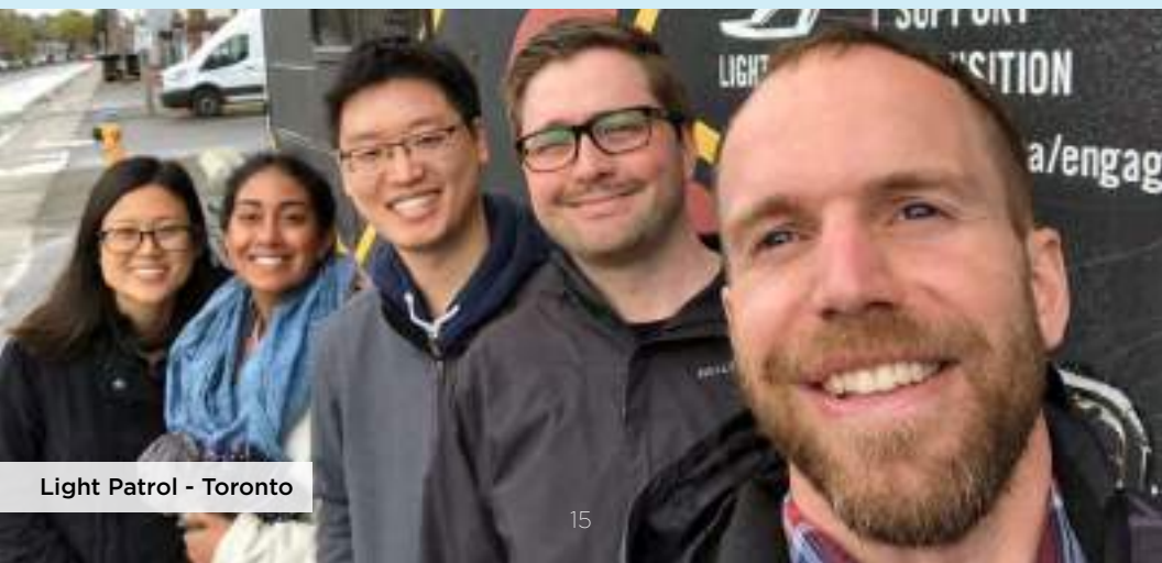
Light Patrol - Toronto

prayer. We shared stories of how God is at work across the country and called people into a deeper fellowship with God and one another. We saw firsthand how our core value of being Saturated in Prayer is taking root and influencing our ministry culture in significant ways. Everywhere we went, people expressed their gratitude for how the prayer tour was helping to encourage and uplift one another in prayer and draw us closer to our Heavenly Father."