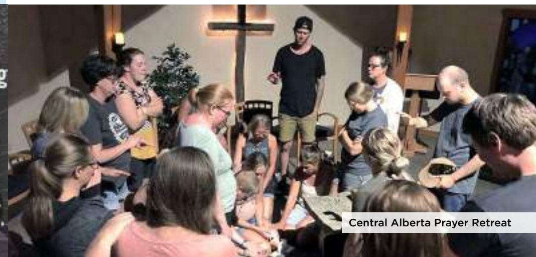
Central Alberta Prayer Retreat