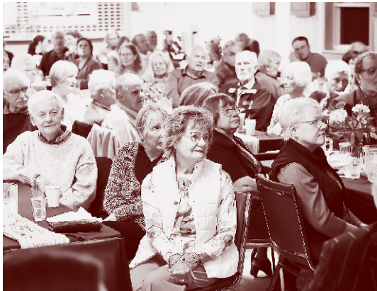
Our annual Fundraising Dinner raised $29,000 thanks to the amazing support of our community. Thank you to everyone who gave, attended, and continues to stand with LYU and local youth.