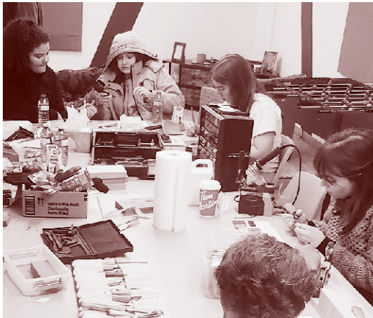
Our new Monday night Carpentry Program is off to a great start! The goal is to help youth learn practical woodworking skills while having faith conversations, and building teamwork, confidence, and creativity along the way.