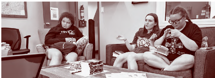
Weekly Bible Study study hosted at the LYU Barn