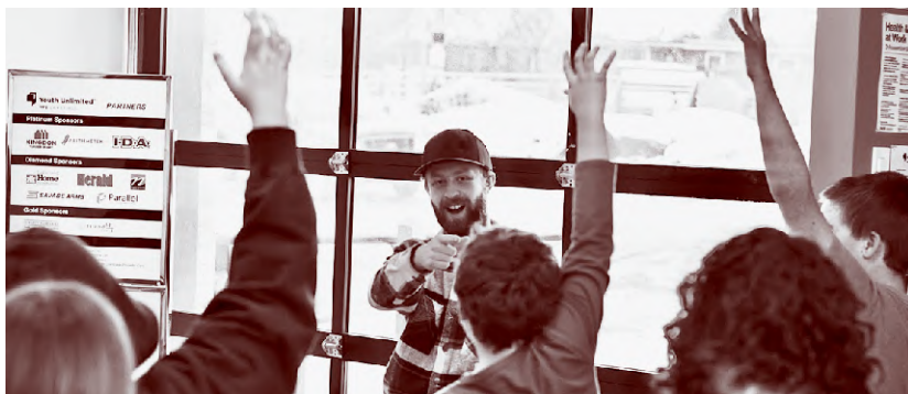
Having fun at Improv!