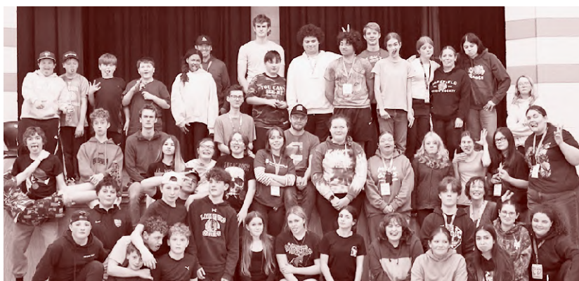
Weekly Gym Night program at the local Elementary School