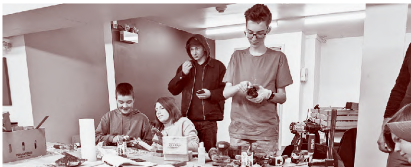
Carpentry Class learning to wood carve