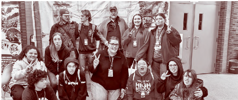
Student Leaders attending Today’s Teen Conference in Toronto.