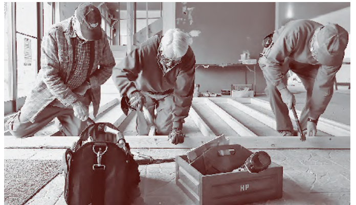
RENOS UNDERWAY ON THE LAKEFIELD BARN

We are also moving ahead with renovations at our new building, the LYU Barn. We are trusting God to provide the funds needed so that our staff can move into the new space by this spring. To date $44,286 of our $80,000 goal has been raised! Please visit lyufundraiser.ca to find ways to donate to this wonderful project.