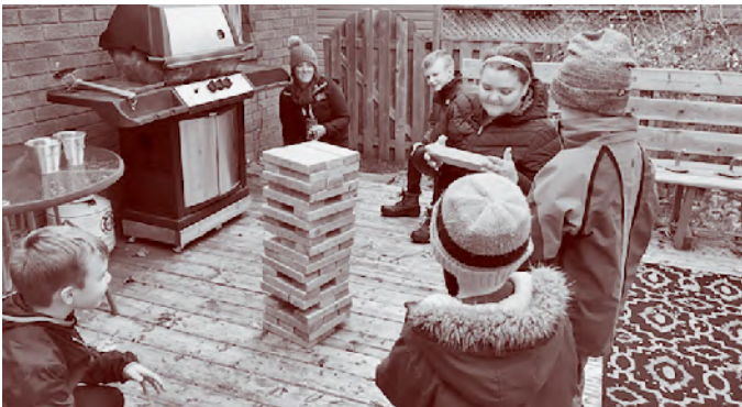
PLAYING GIANT JENGA WITH A LAKEFIELD FAMILY