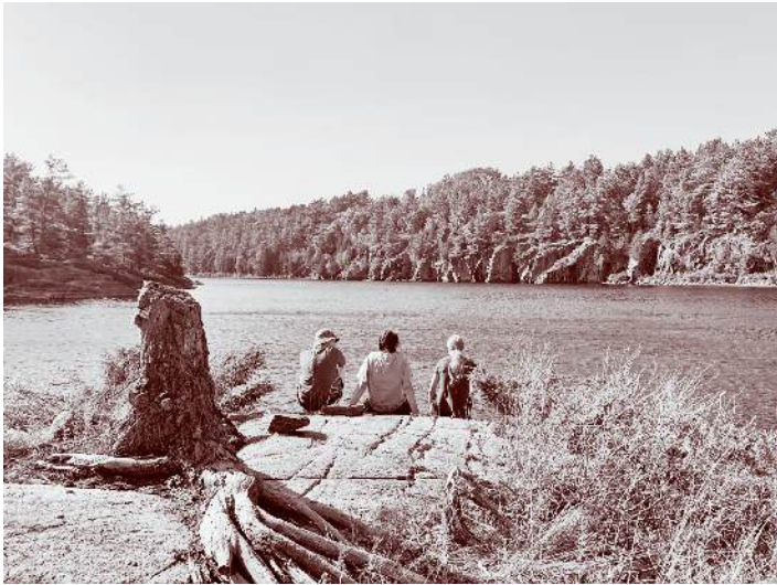
Summer 2024 Camping Trip - Building Relationships in God's Creation