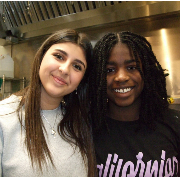
Our smiling student on the right alongside a volunteer