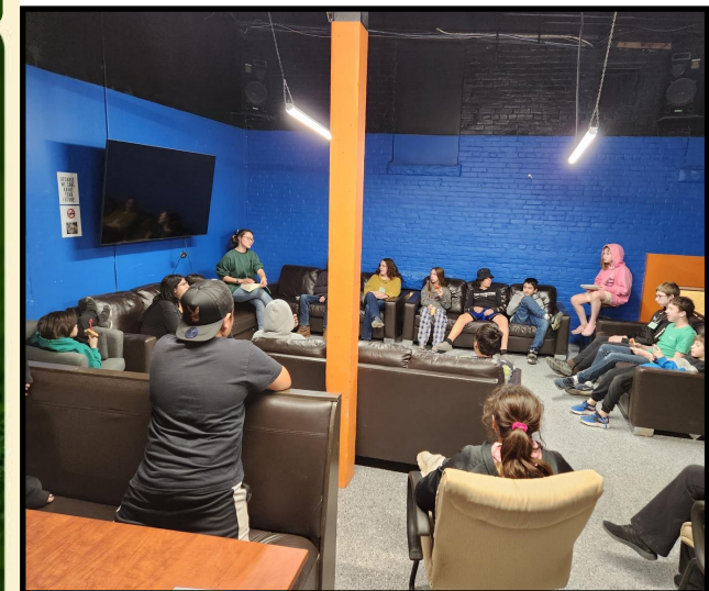
God Talk time at a Jr. Drop-In.